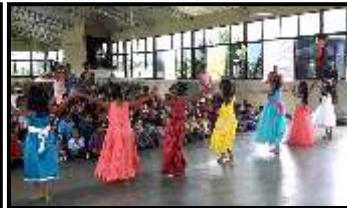
Dance performed by the primary students