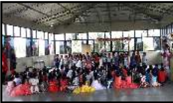
Children's Day was held at Lyceum Kandana on 02/10/2017.