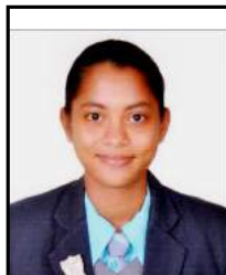
Pasadi Litara Devapura