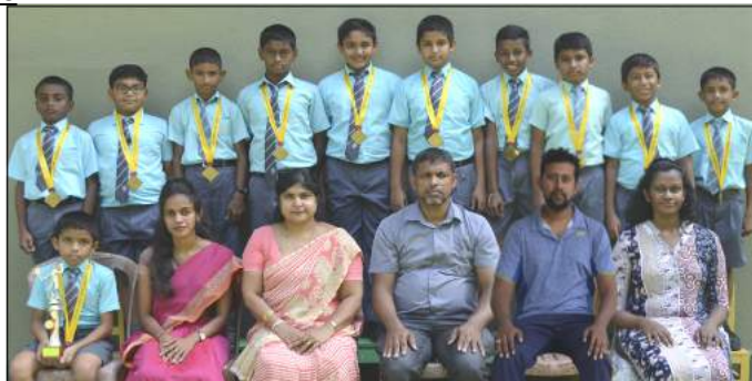
BOYS CHAMPIONS - DIVISION D