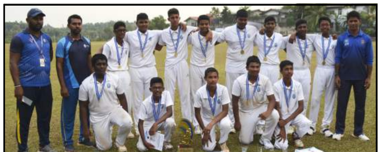
LYCEUM PANADURA - CHAMPION TEAM