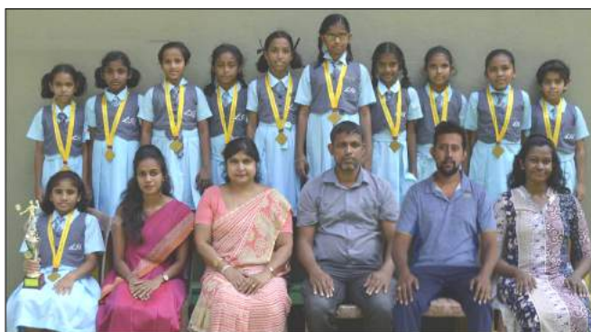
GIRLS CHAMPIONS- DIVISION C